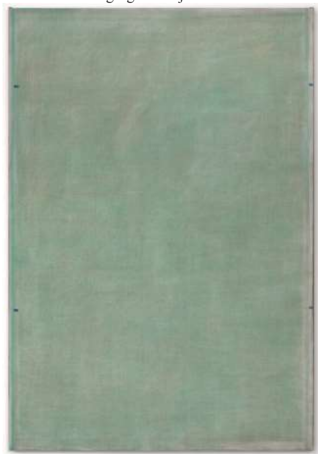
John Zurier: Late Afternoon in Three Parts (Innsigling) , 2017, glue-size tempera on linen, 84 by 58 inches. Courtesy Peter Blum Gallery, New York

JOHN ZURIER I'm happy you see it that way. I think it was a process of distillation. I can't say what inspired it exactly. I was aware of wanting my paintings to be tougher and more resolute—especially since I am dealing with evanescence, with dematerialized densities of paint, color and light. All the paintings in that show were completed in a new studio. For thirty years I painted in studios with large skylights, where the light was really intense and coming from above and bouncing all over. In my new studio I have a long wall of floor-to-ceiling, north-facing windows. The light is still bright, but more diffuse, colder, and it comes from the side instead of the top. I can see the surface of the paintings better in the raking light. It's just different.