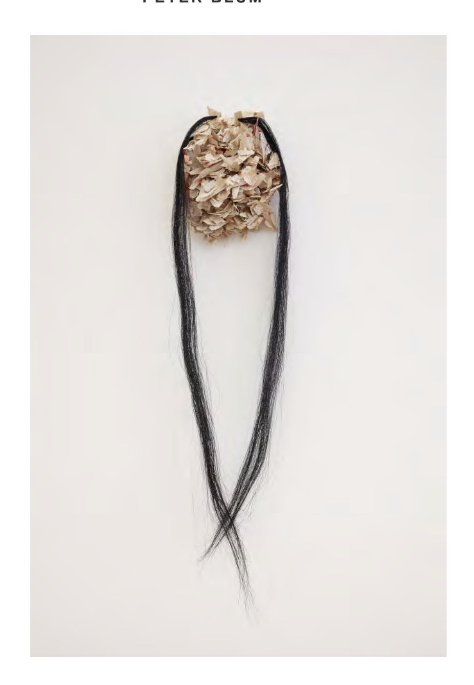
Nicholas Galanin Woman, 2016 wood carving and hair 42 x 8 1/2 x 4 inches (106.7 x 21.6 x 10.2 cm) (NGA16-03)