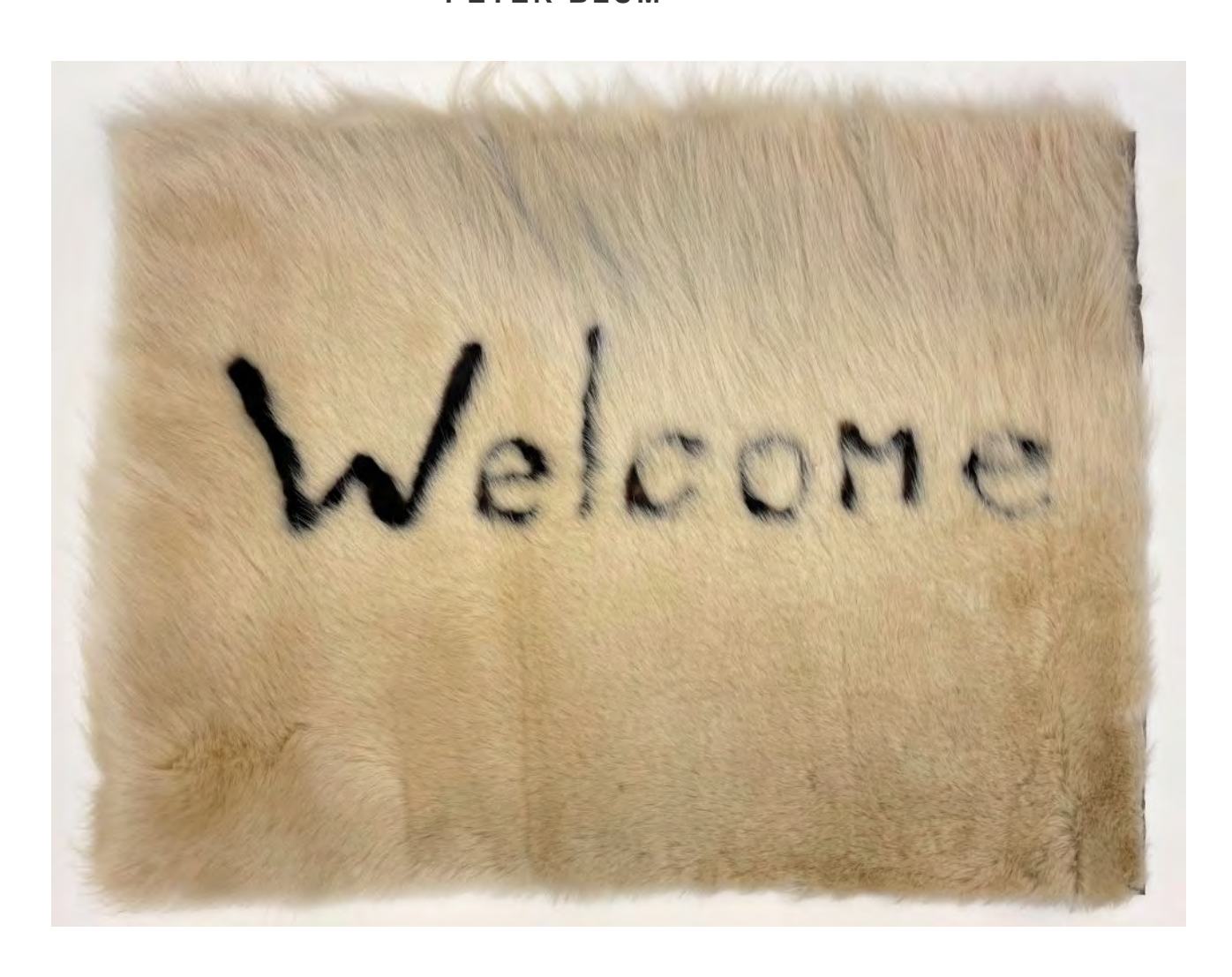
Nicholas Galanin Welcome, 2009 polar bear hide and sea otter hide 36 x 48 inches (91.4 x 121.9 cm) (NGA09-01)