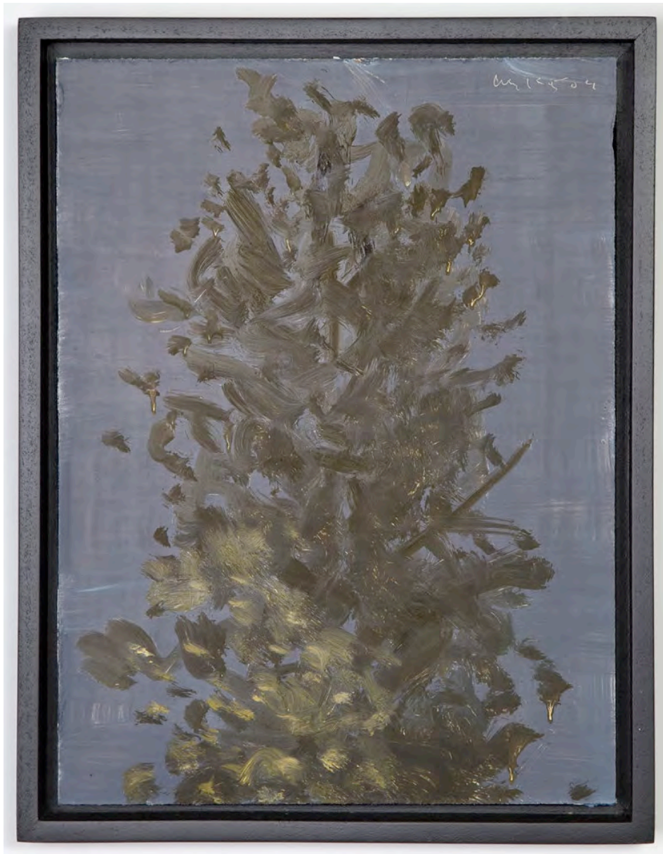
Alex Katz Urban Oak 4, 2004 Oil on board 12 x 9 inches (30.5 x 22.9 cm) (AK1109)