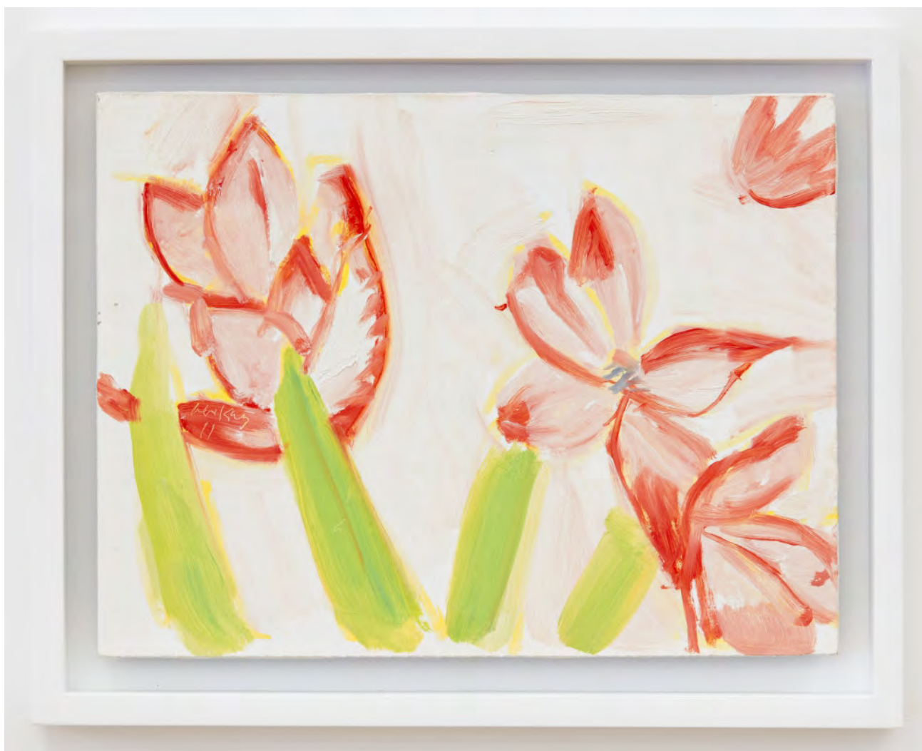
Alex Katz Flowers, 2011 Oil on board 9 x 12 inches (22.9 x 30.5 cm) (AK11-67) $ 75,000