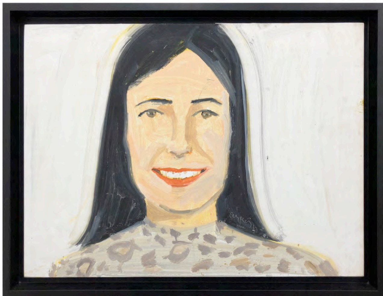
Alex Katz Tarajia , 2013 Oil on board 12 x 16 inches (30.5 x 40.6 cm) (AK13-13) $ 85,000