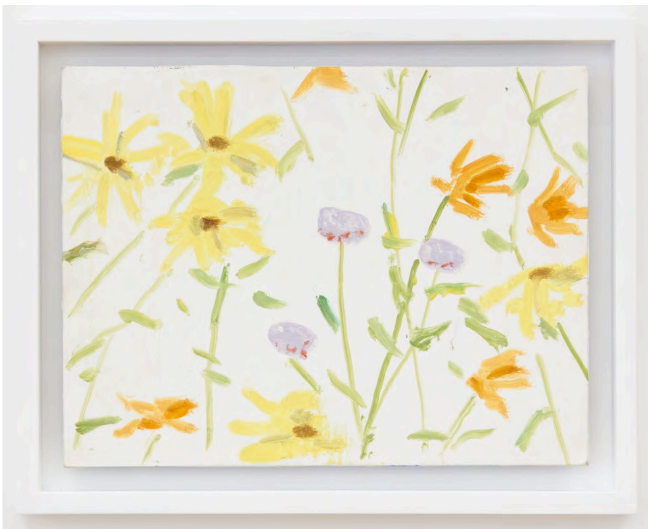
Alex Katz Flowers 3, 2010 Oil on board 9 x 11 3/4 inches (22.9 x 29.8 cm) (AK10-82)