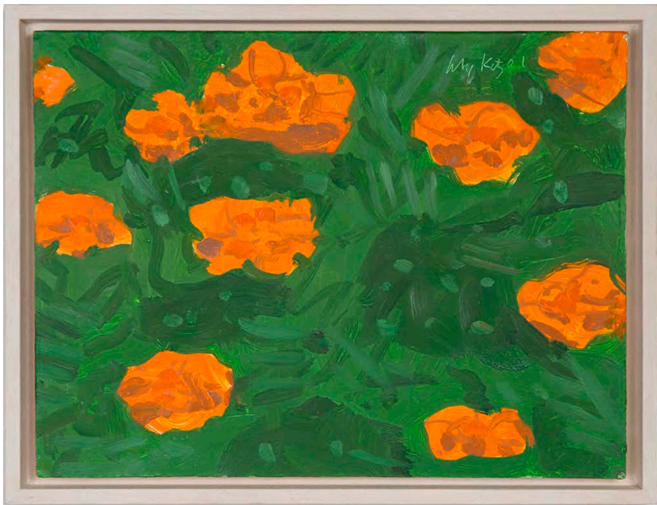
Alex Katz Marigold 1 , 2001 Oil on board 9 x 12 inches (22.9 x 30.5 cm) (AK0774) $ 75,000