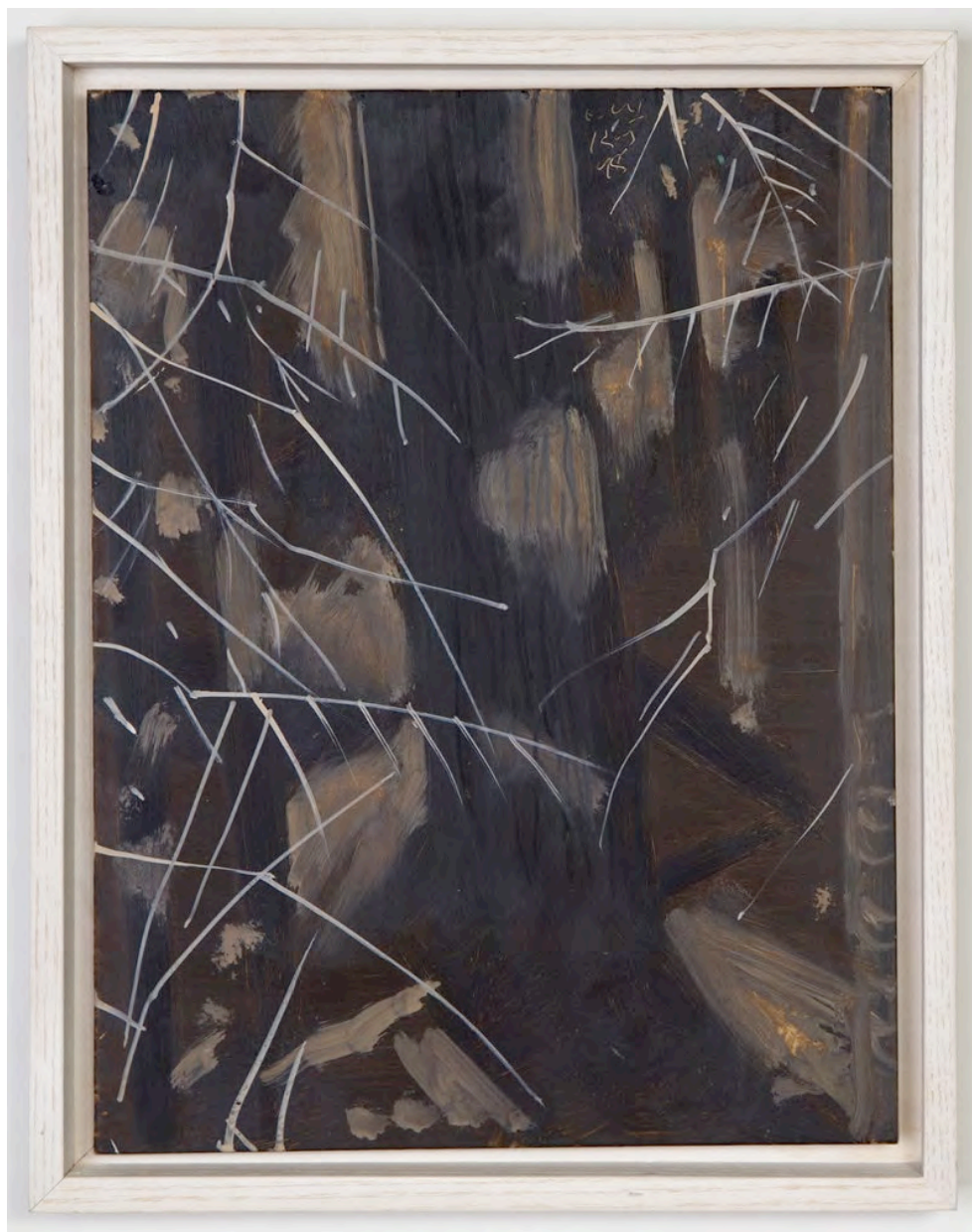
Alex Katz Days End , 1998 Oil on board 12 x 9 inches (30.5 x 22.9 cm) (AK1060)