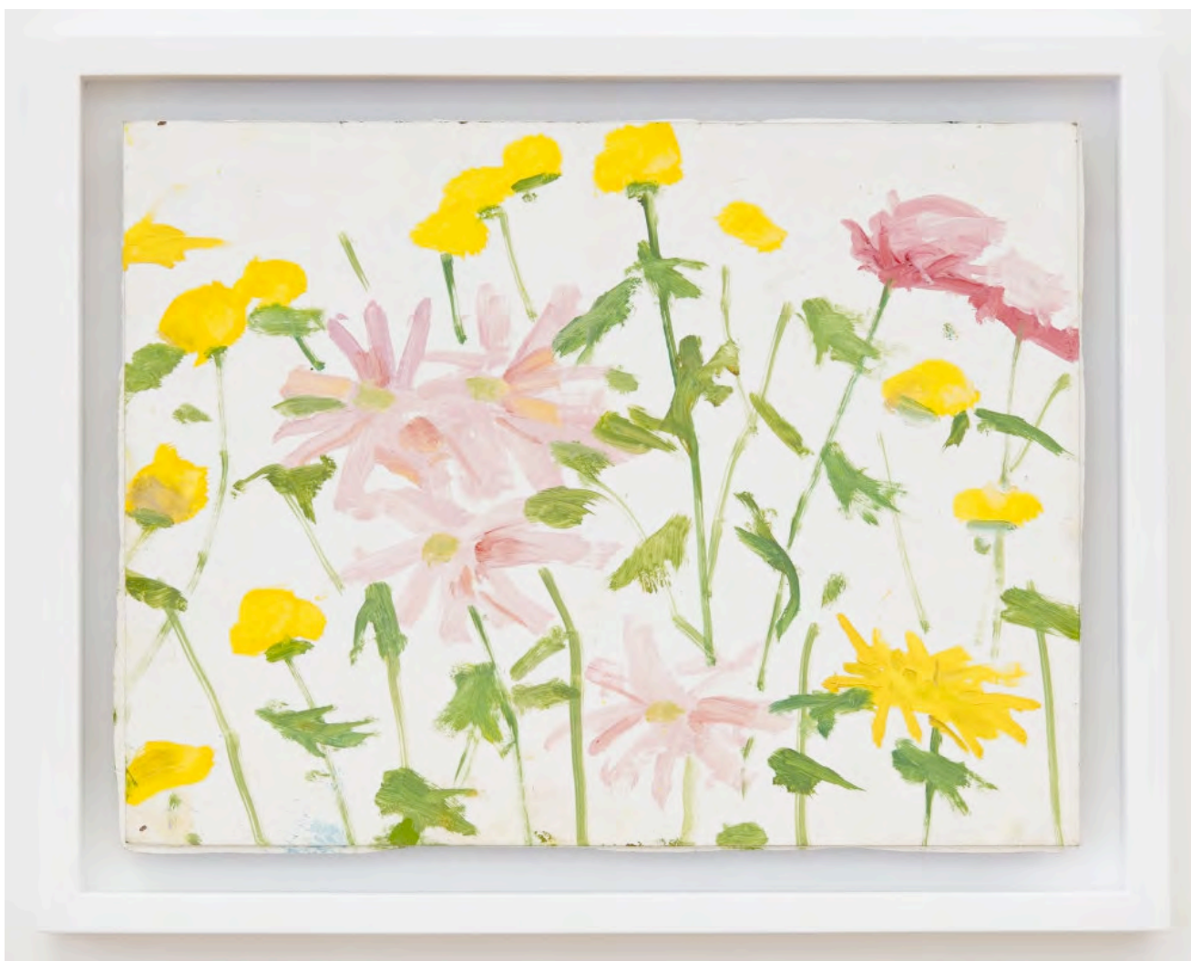
Alex Katz Spring Flowers 1 , 2011 Oil on board 9 x 12 inches (22.9 x 30.5 cm) (AK11-66)