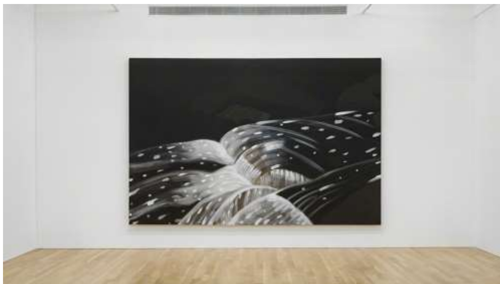
Alex Katz. Courtesy of Peter Blum Gallery

16 Nov 2017 — 13 Jan 2018 at Peter Blum Gallery in New York, United States 13 DECEMBER 2017